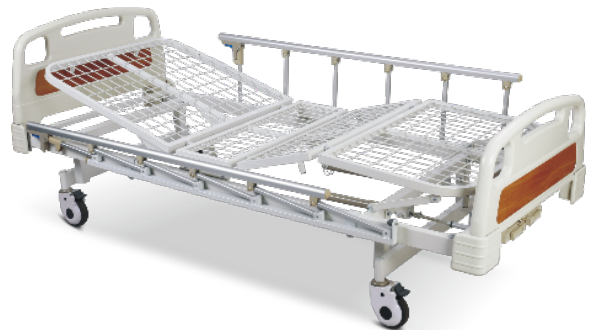
EK3020 MANUAL 2 CRANKS