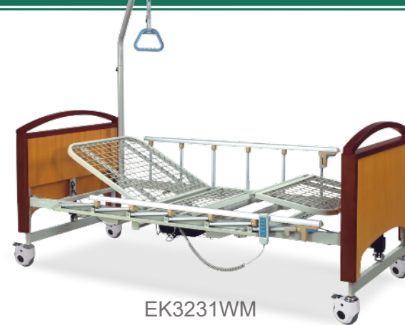
EK3231WM ELECTRIC 3 FUNCTIONS