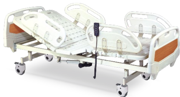
EK3222WB ELECTRIC 2 FUNCTIONS