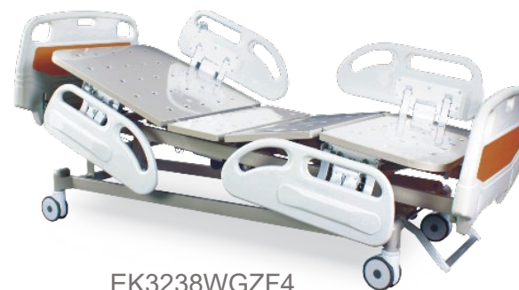
EK3238WGZF4 ELECTRIC 5 FUNCTIONS