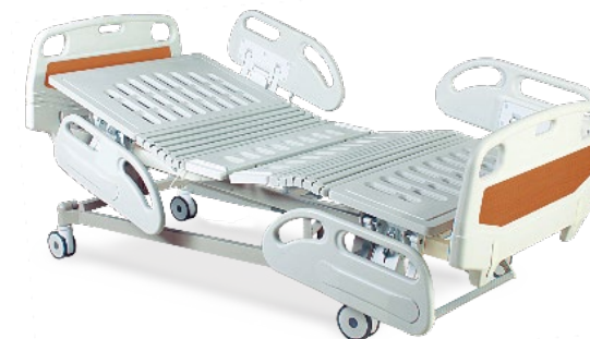
EK3239WZF4 ELECTRIC 5 FUNCTIONS