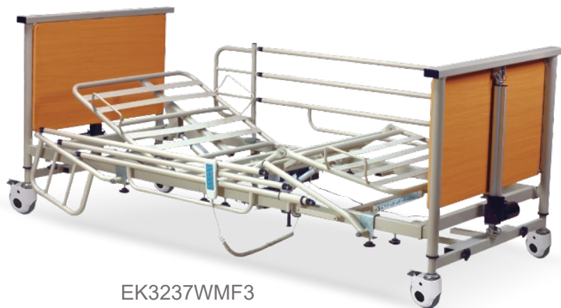
EK3237WMF3 ELECTRIC 3 FUNCTIONS