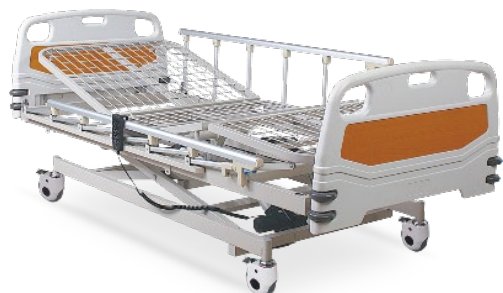
EK3236W ELECTRIC 3 FUNCTIONS