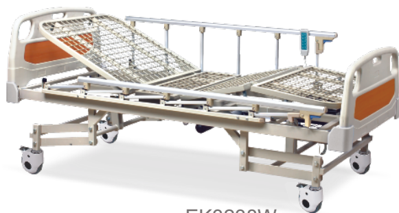
EK3238W ELECTRIC 3 FUNCTIONS